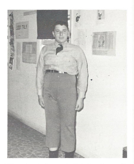
"Our best dressed Sub-Freshman."