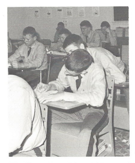
"The Honor Council is watching you."