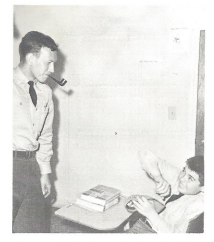
"But Sir, I don't speak the English."