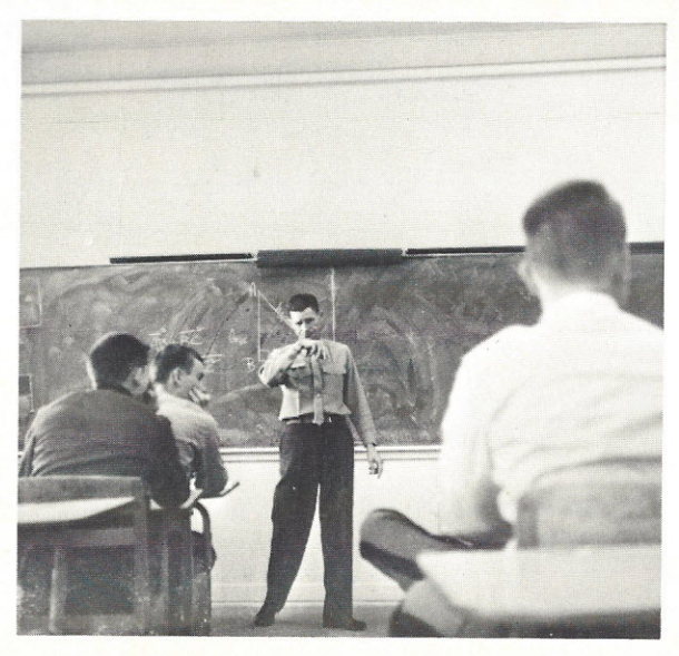
"10:30? No, we will NOT get out of class early."