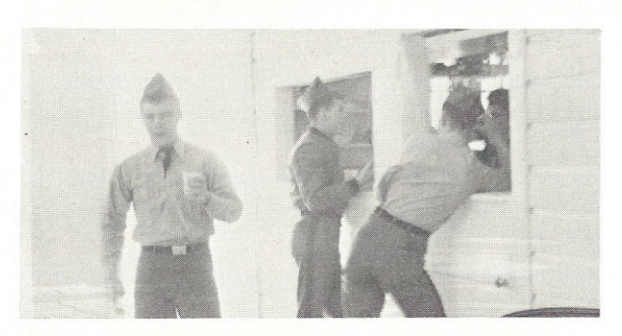
"I finally got a Falstaf!"