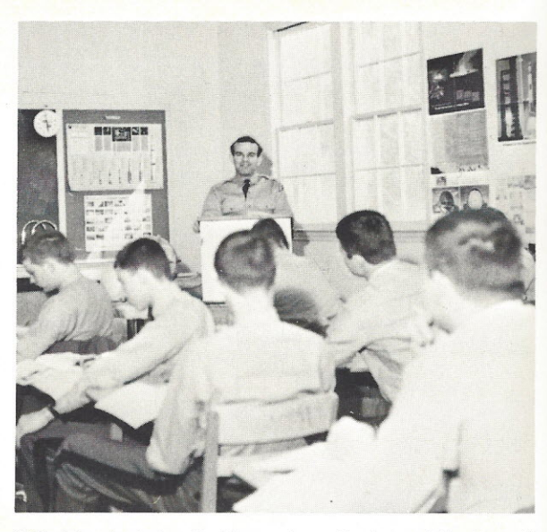
"My friends, today I will speak on the Joys of Geology."