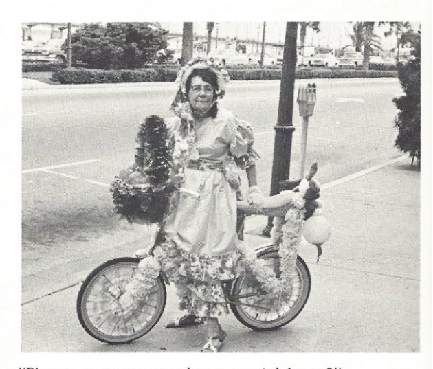
"Please, may my son have special leave?"