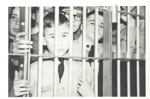
"Restricted study hall."