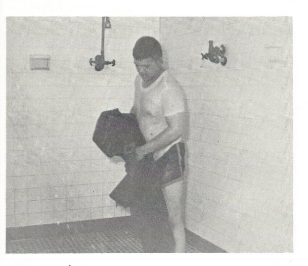
"Laundry dây at CMA."