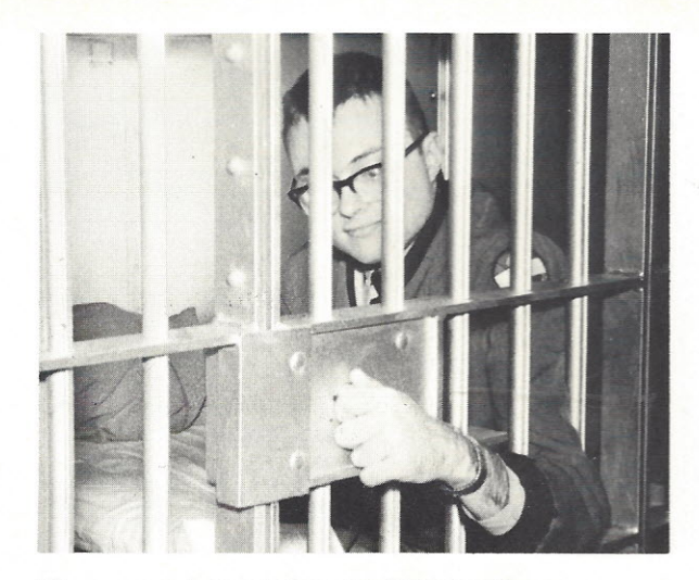
"Former graduate makes the big time!"