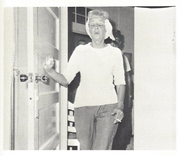
"Oh, you poor sick boy!"