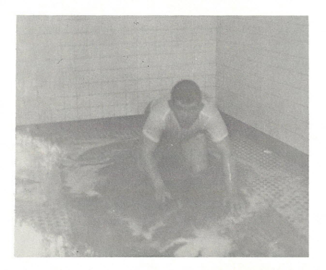
"Did you have to get sick in MY room?"