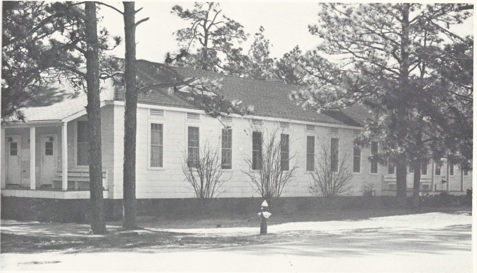
Band and Staff