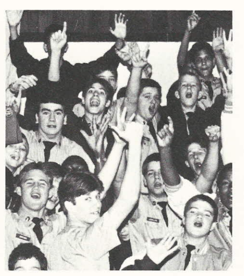
Esprit de corps exhibited by cadets at basketball games is clearly evident here.