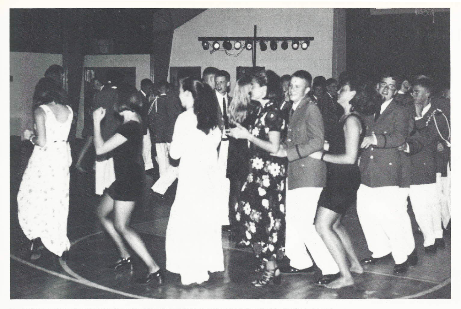
The first dance of the year is always a big event at CMA. This year, somehow, the girls seemed prettier; the cadets, happier.