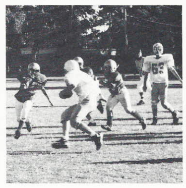
About to run out of room, Guest has picked up good yardage on this play.