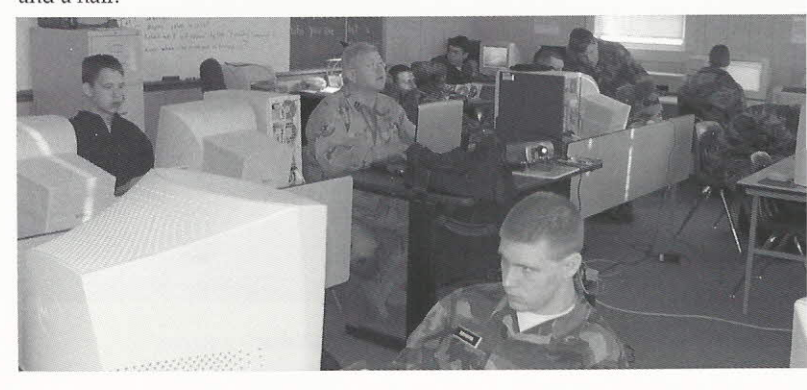
Whether it is English, history, French, calculus, or computer science, we get involve in learning, the most important part of our day.