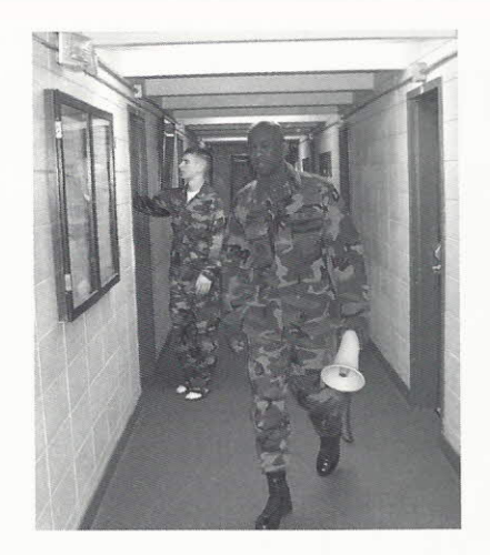
It starts at 6:00 A. M. with the Tac or the CO or both making noise to roust us out, sometimes with a siren.