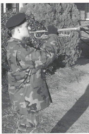
Before breakfast come the Pledge of Alle giance and a prayer.