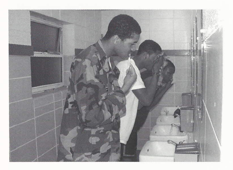
Then we shower, shave, brush our teeth, and get ready to handle whatever the day might bring.