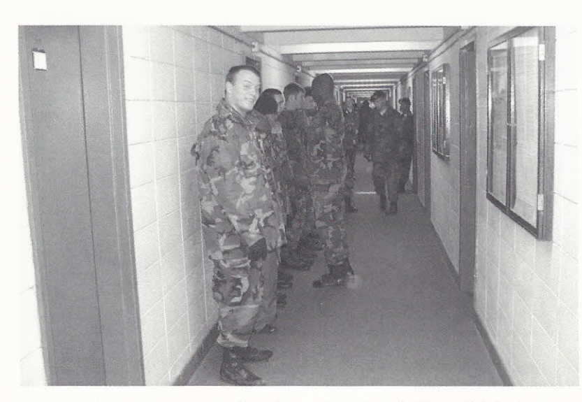
After room inspection comes uniform inspection, when the Tac and Co look us over from head to foot.