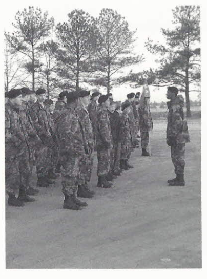
Finally, we are ready to leave the barracks. We form up and march out.