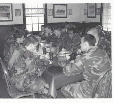
At breakfast we are always hungry. We have been up and working for an hour and a half.