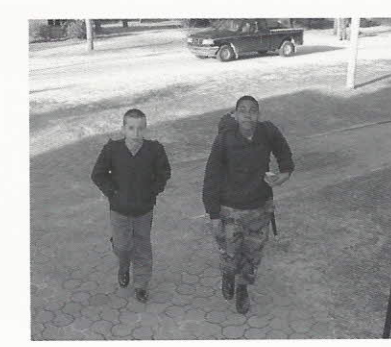
After breakfast, we return to the bar racks, get our books, and walk to class