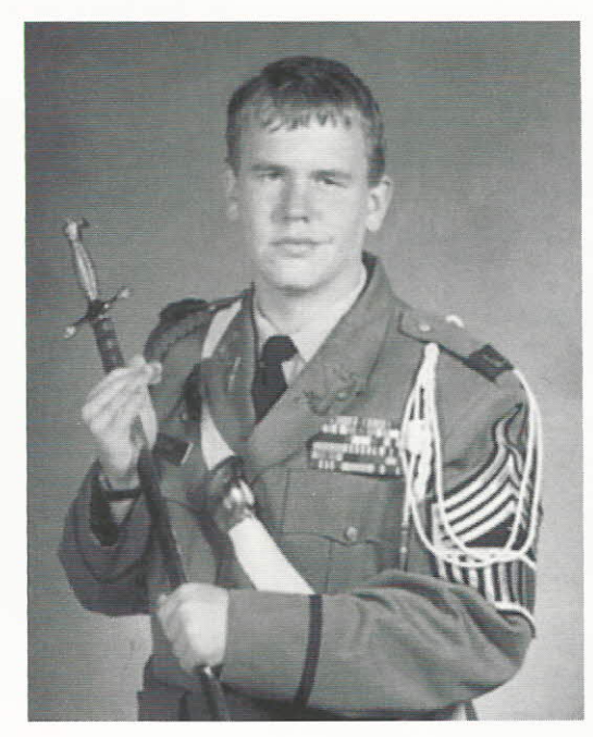
Life is like a bar of candy Many highs and lows You made it with flying colors, though. Congratulations, Son. I'm proud of you. I Love you, Mom