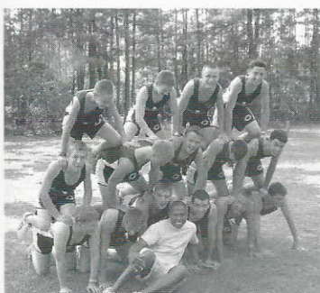
"Oh, we are going to fall!"