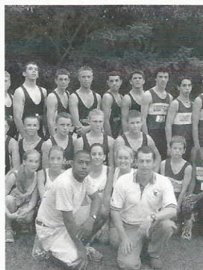
CMA and L-E have the county's only cross-country teams. Over the past three seasons CMA has yet to lose to L-E.