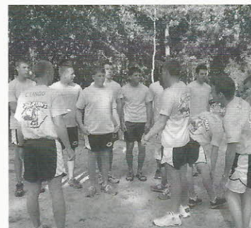
The CMA runners prepare to run through the woods.