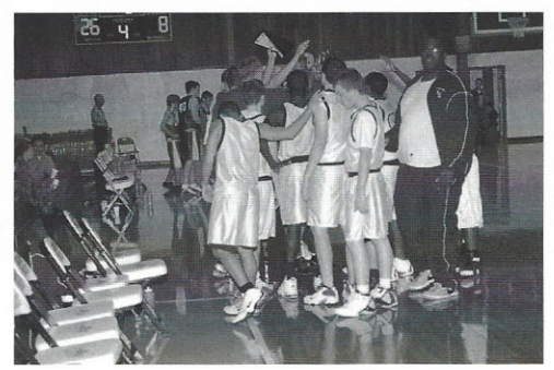
The Spartans get ready to go back into action after a time out.