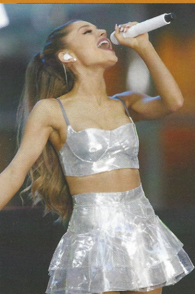
ARIANA GRANDE 2