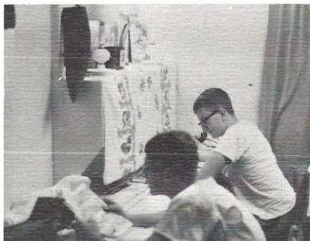
STUDYING FOR A COMIC BOOK QUIZ.