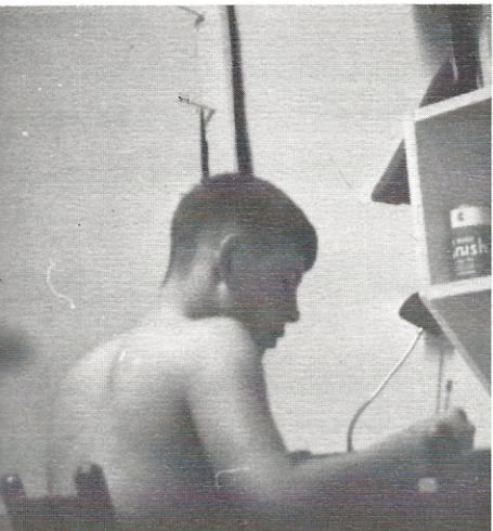
HE'S REALLY JUST FAKING IT.