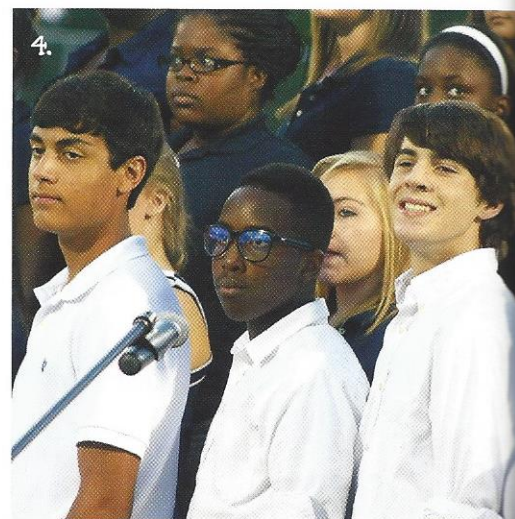
3. Chorus students flock together to sing the National Anthem at the Homecoming Game.