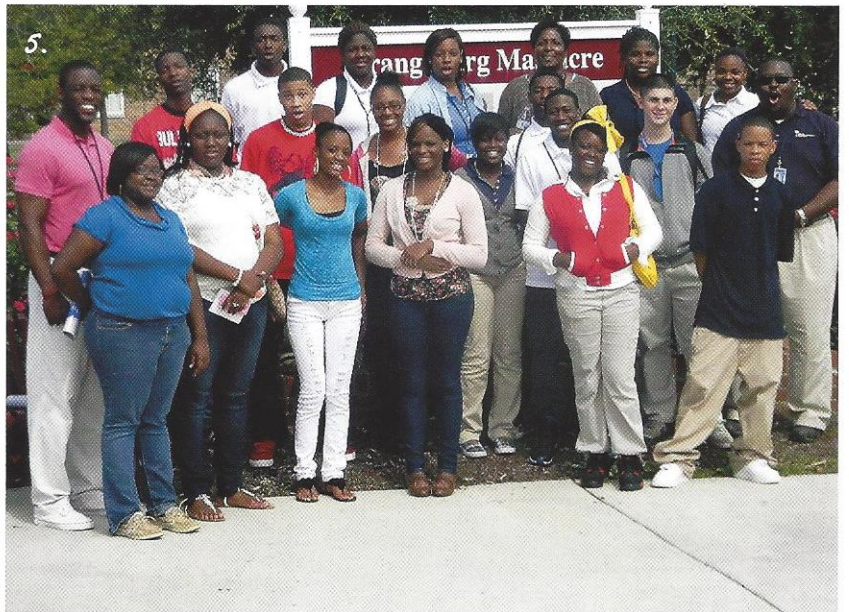
5. JAG students were influenced by all the field trips they went on throughout the year. During most of the trips, they took time to capture the moments on camera to document their success.