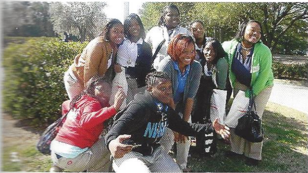
1. Part of the JAG class stands in front of the fountain at CCHS. Most students in JAG would say that their organization was well known throughout the school and influential to the students.