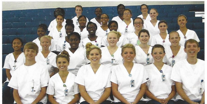
4. The students of HOSA host the annual 'Pink Out'. Breast cancer awareness posters were found around every corner, and the students were allowed to wear their favorite pink shirts to school.