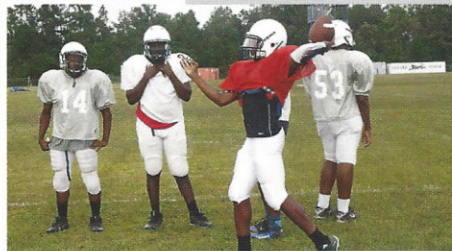
ABOVE: The boys throw the football back and forth while at practice.