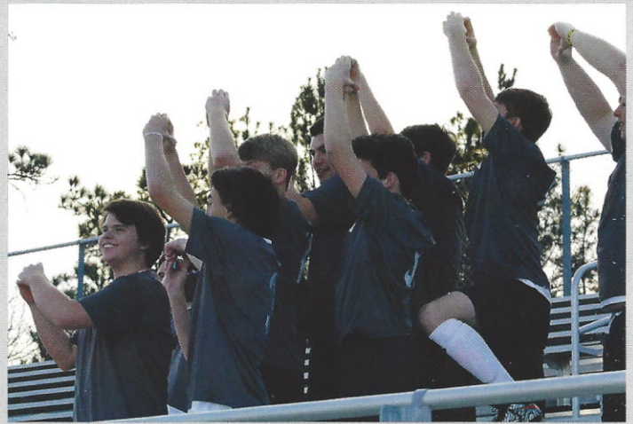
While watching the Junior Varsity game, the Varsity team holds up hearts to their teammates, wishing them good luck before the first whistle blows.

"I MAY WIN AND I MAY LOSE, BUT I WILL NEVER BE DEFEATED."