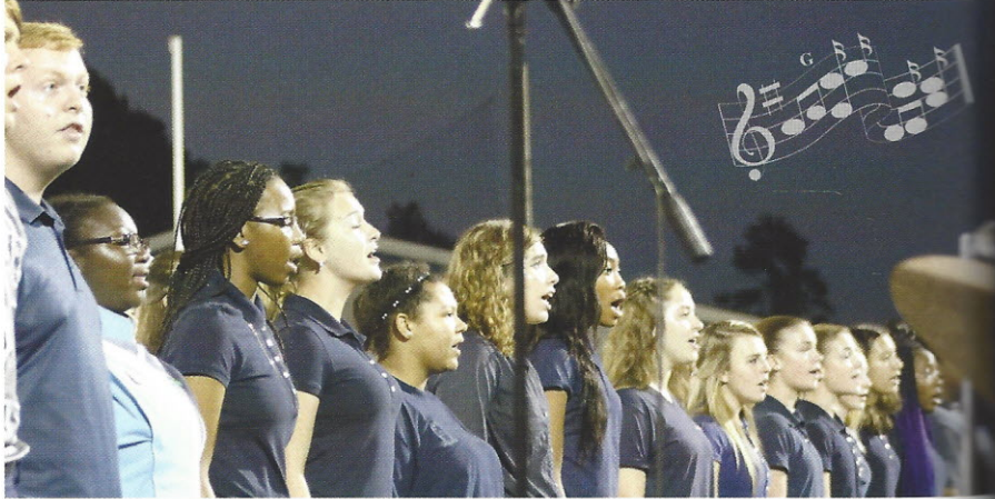
At Homecoming, the Colleton County Chorus gave an inspirational show to kick off an amazing night.