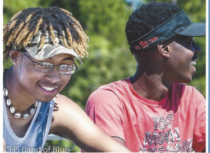
CHS Band of Blue

I've never seen a group of people that works so hard together to achieve a single goal-- to be superior. These students work countless hours, day and night, no matter the weather conditions, constantly getting better and better and making the organization known. That's the Band of Blue.