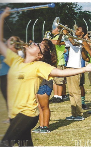
(Left) - During the summer, the band and color guard practice for their first show on one of our game nights. While others are still on break, they're hard at work.