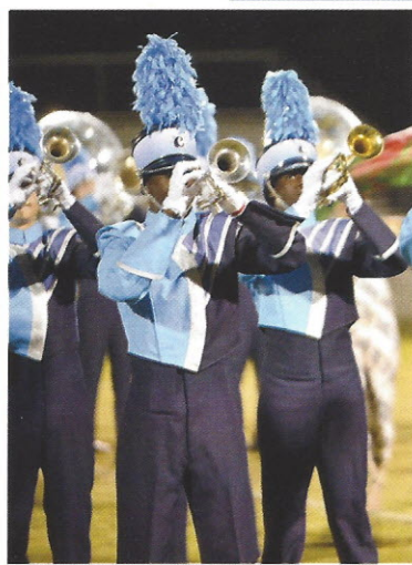
(Right)- The trumpet section of the band creates the melody for the band on Senior Night.