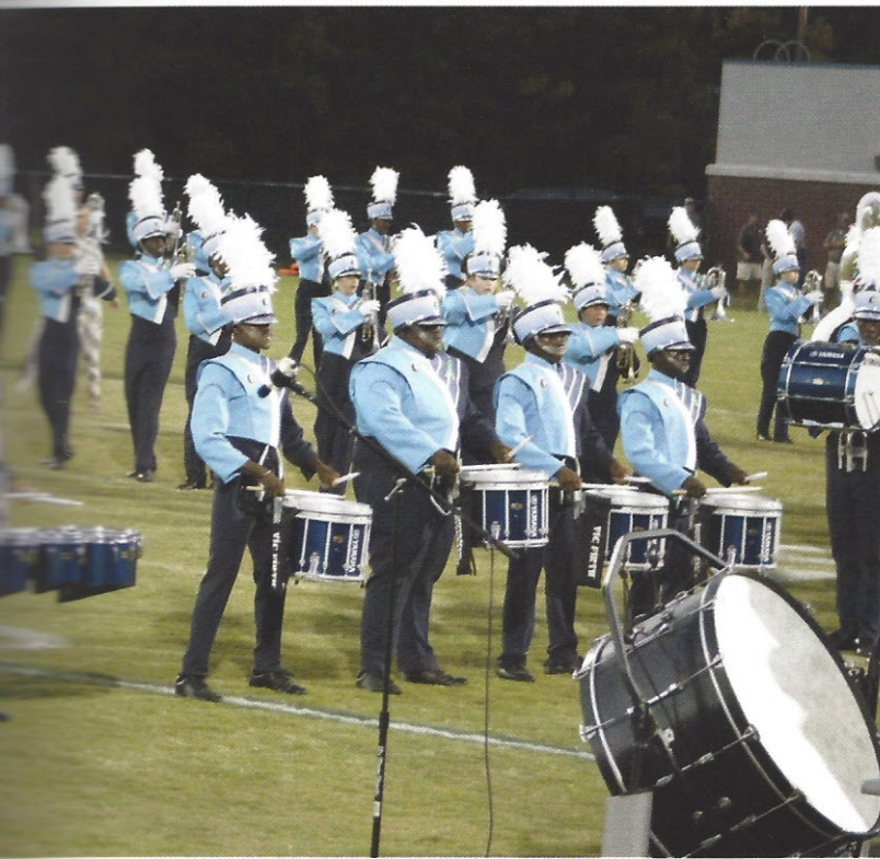
Drumline: The heart and bass of the band. The drumline keeps the tempo of the music. They're also the reason you want to clap and dance when the Band of Blue starts playing!