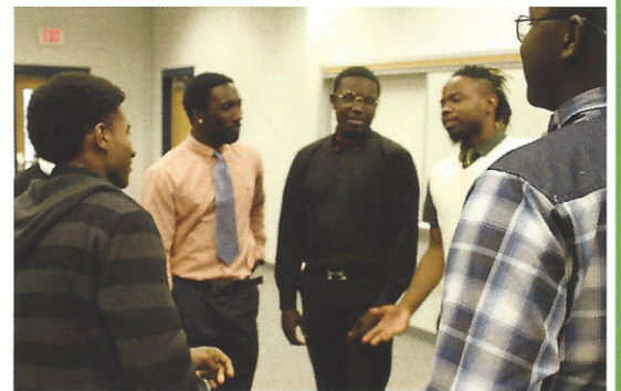
Cougar Men of Distinction have a brief meeting to plan for their upcoming trip to Alabama in May of 2018.