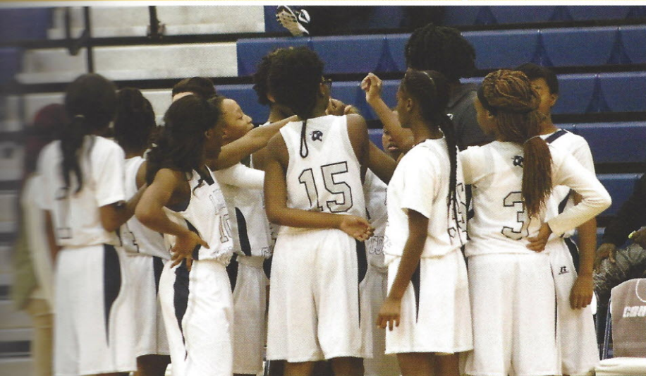
When the girls get ready for their opponents in the Cougar Den, they take one last time to wish each other luck and promise to give the game all they've got. In order to succeed, they know to follow the game plan and putt in as much work as possible.