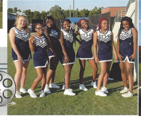
LET'S CO COUCARS On a sunny fall day, the team works to rally the crowd on the sideline, showing their Cougar Dride.

"A good cheerleader is not measured by the height of her jumps but by the span of her spirit." –Anonymous