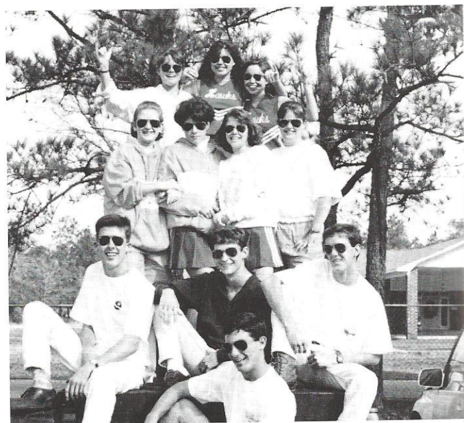
These students have a future so bright they have to wear shades. Ray Ban sunglasses are a big trend at CPA among the high school students.