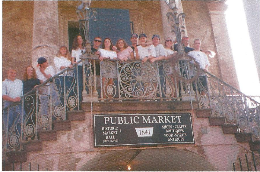
While in Charleston, the Senior Class poses for a picture at the Market.

On September 23, the Senior Class took a day off from school and made their way to downtown Charleston. The Seniors walked to Waterfront Park where they enjoyed the swings and the fountains. Then, they decided to walk down to the Market. On their way down to the Market, they viewed many Charleston shops. After shopping at the market, they decided it was time to eat. Most of the class went to Applebee's. Then, after eating they returned home.