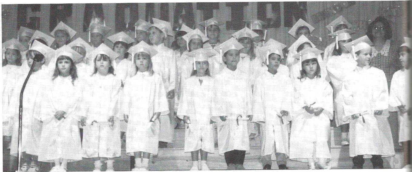
The Kindergarten Class of 1997