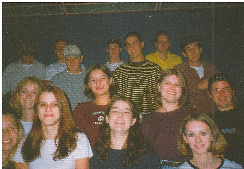
The Seniors put on their game faces before heading off to the Q-Zar Battle Arena.