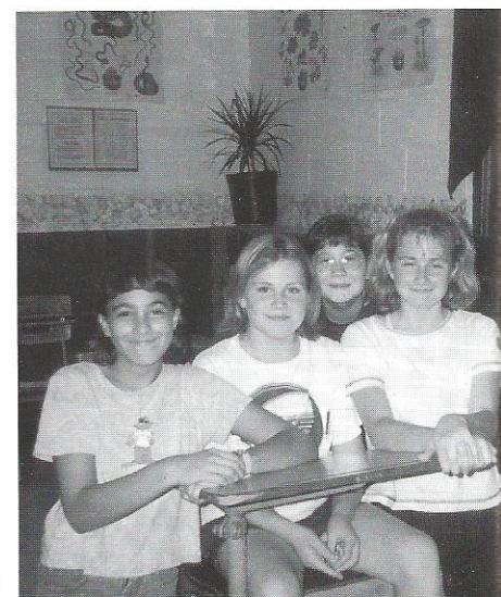
Smiles help these girls make it through the day.