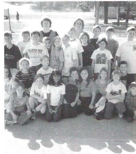
The entire 4th grade gets together for a picture.