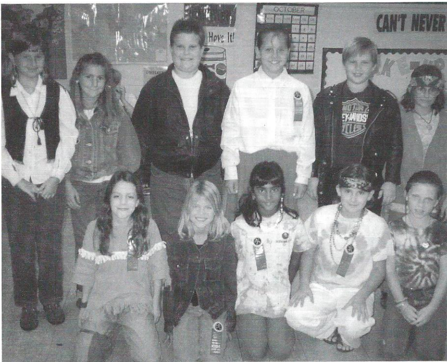
These 4th graders show off their retro outfits.