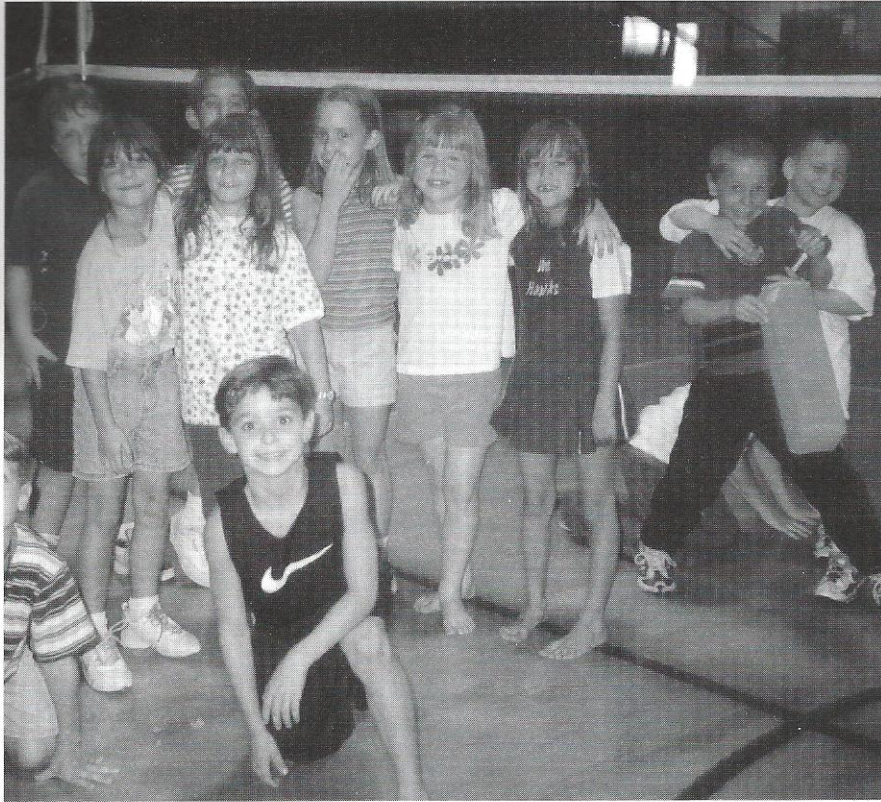
The second grade could always be found working hard on their studies.