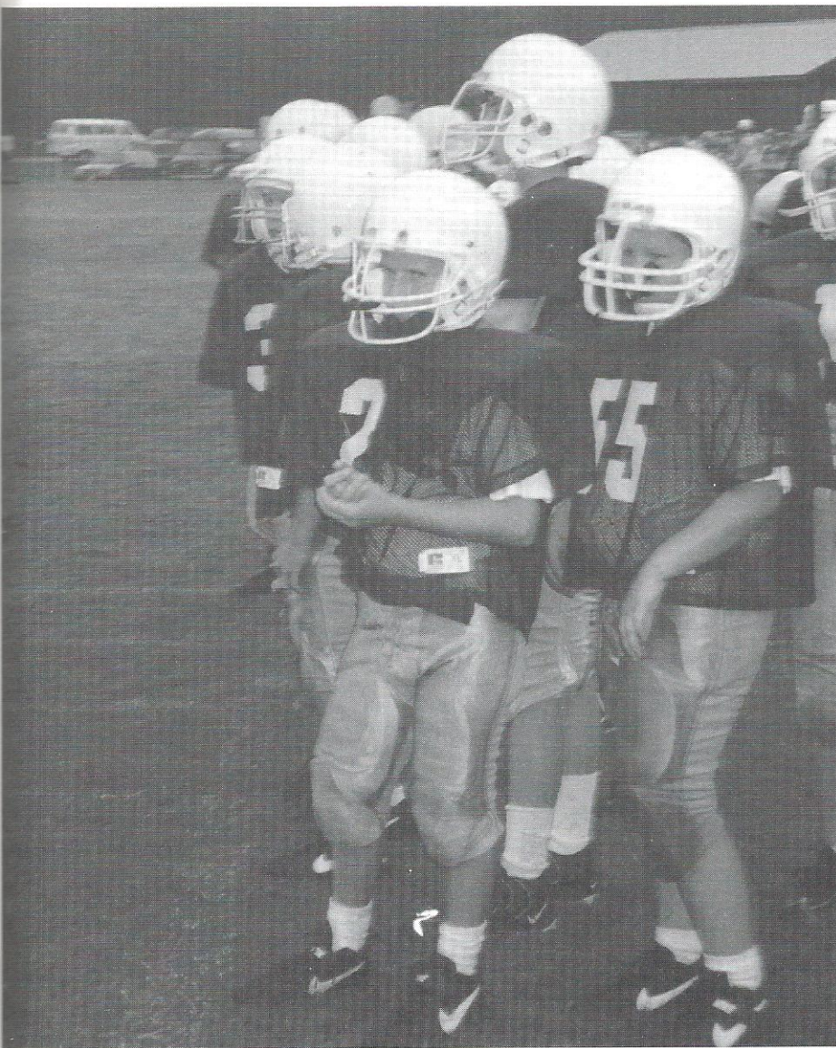
These anxious young players wait patiently for their chance to step onto the gridiron.