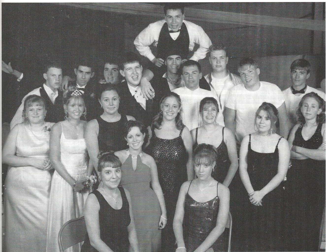
The Junior class takes a break from the dance floor. Wow! What a group!!