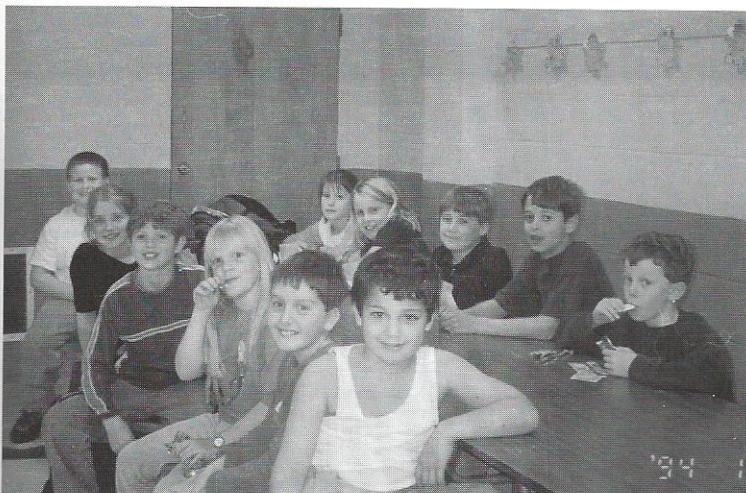
As usual, these kids are hard at work studying and doing homework.