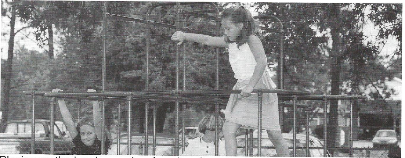
Playing on the jungle gym is a favorite afterschool activity for many young students.