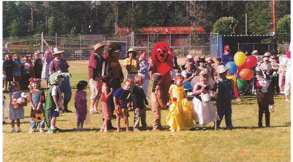
It's a mini-Merlin!>>>

Wow! A pirate, Dorothy from the Wizard of Oz , and the tooth fairy, all in one group!