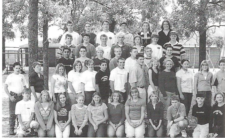
Class of 2006