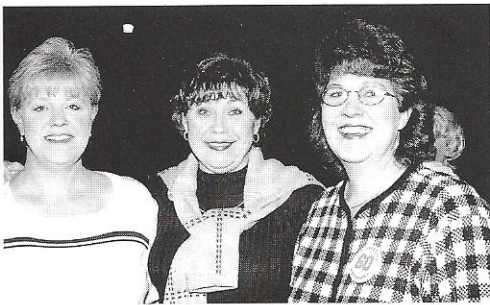
The moms try to hold back their tears on Senior Night