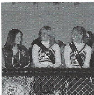
EXCITEMENT IS HIGH FOR THESE THREE AS THEY WAIT EAGERLY FOR HALF TIME.