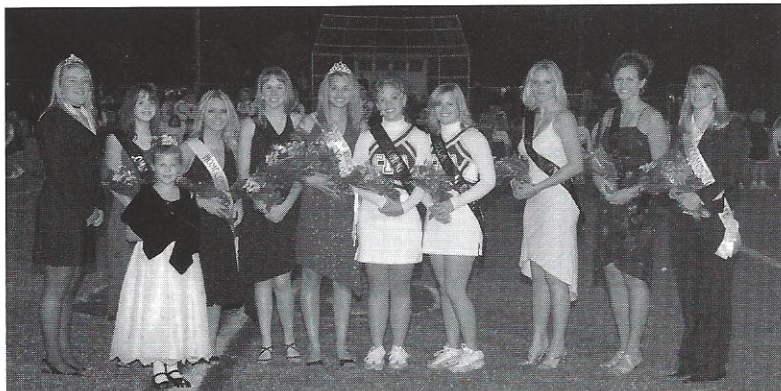
THE HOMECOMING COURT, CLASS REPRESENTATIVES, AND QUEEN OF HEARTS JOIN TOGETHER FOR A GROUP PHOTO.