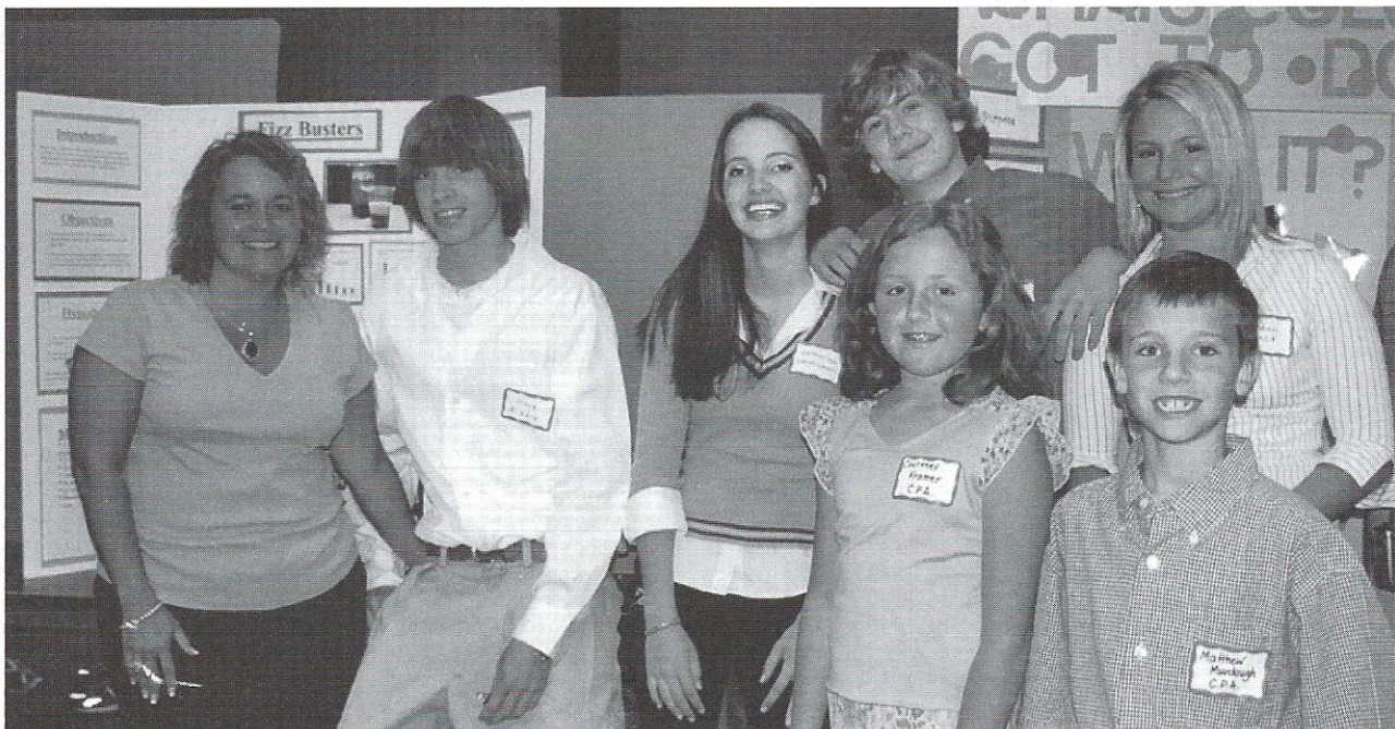
SCIENCE FAIR WINNER FROM 2004