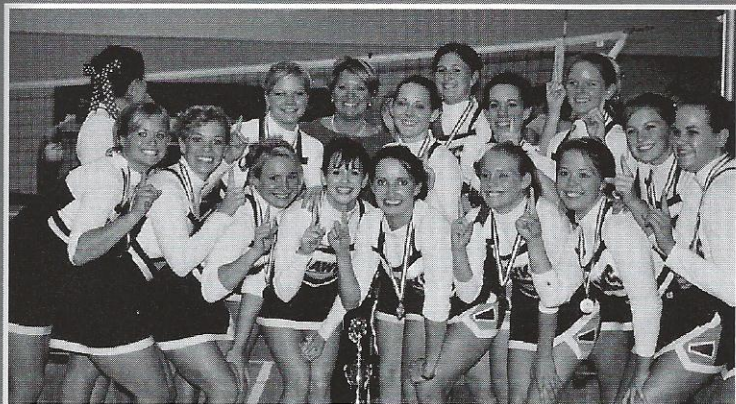
The cheerleaders are elated to win the title of State Champs! Congratulations!