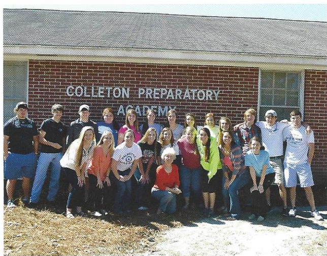
Class of 2014 in 2010.....and in 2014!!!