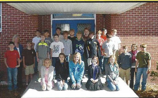
Class of 2020