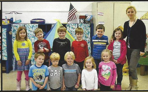
Class of 2026