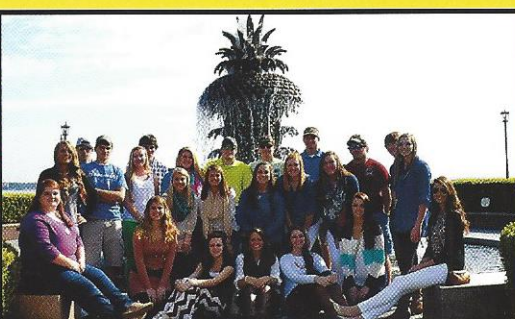
Class of 2014