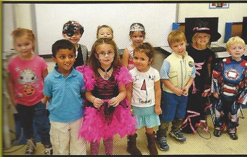
Class of 2027