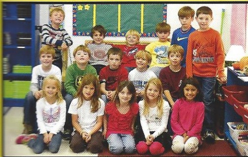
Class of 2024