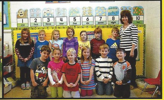
Class of 2025