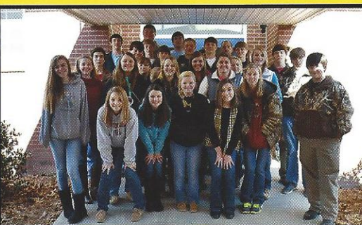
Class of 2017