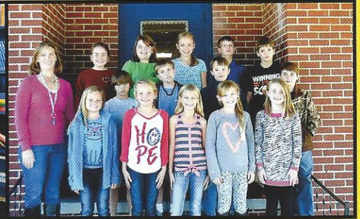
Class of 2022