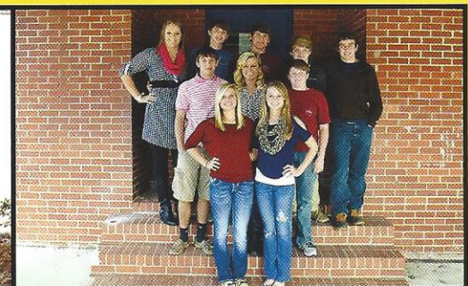
Class of 2016