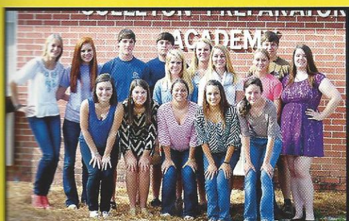
Class of 2015