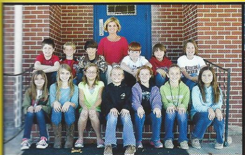
Class of 2021