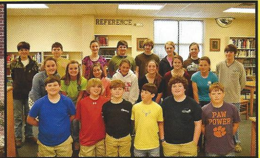
Class of 2019