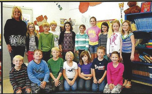
Class of 2023