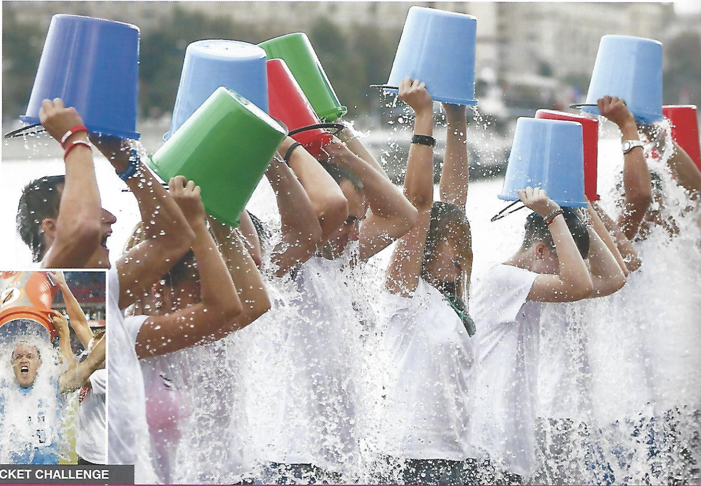
1 ICE BUCKET CHALLENGE