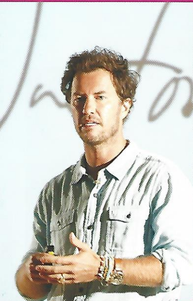
TOMS AT TARGET 2