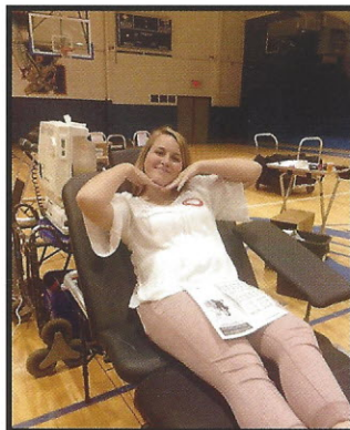
STUDENT COUNCIL SPONSORED IT FIRST EVER BLOOD DRIVE AND HAD A GREAT TURN OUT. MANY STUDENTS AND PARENTS DONATED 33 PINTS OF BLOOD.