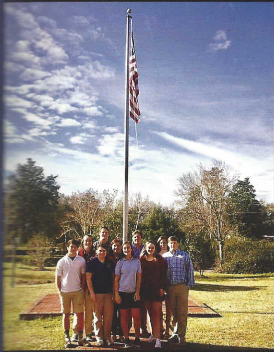
10TH GRADE CLASS OFFICERS SPENT THE DAY VISITING ST. JOHN'S CHRISTIAN ACADEMY.