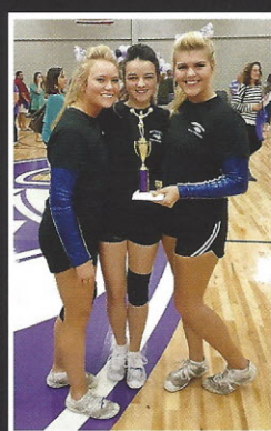
Above: The three seniors pause for a moment to take a picture with the second place trophy.

The competition team is more than an average team. It is a family made up of girls from sixth grade to twelfth grade. With having such a wide range of age groups the team had many more obstacles to overcome than any other team. The girls had to start from the beginning. Each of the