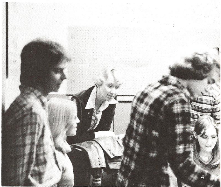
1. What do I do next? 2. I can't believe I'm doing this! 3. A Professional?? 4. Let's do it right this time!!! 5. We did it!!