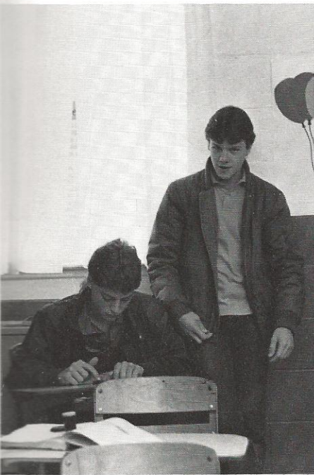
This looks like the start of a successful club!