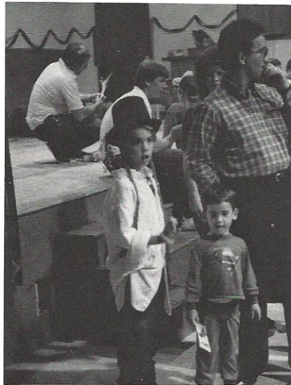
The younger students enjoy dressing up in various costumes for Halloween. Boy George and Superman were two of the most popular.