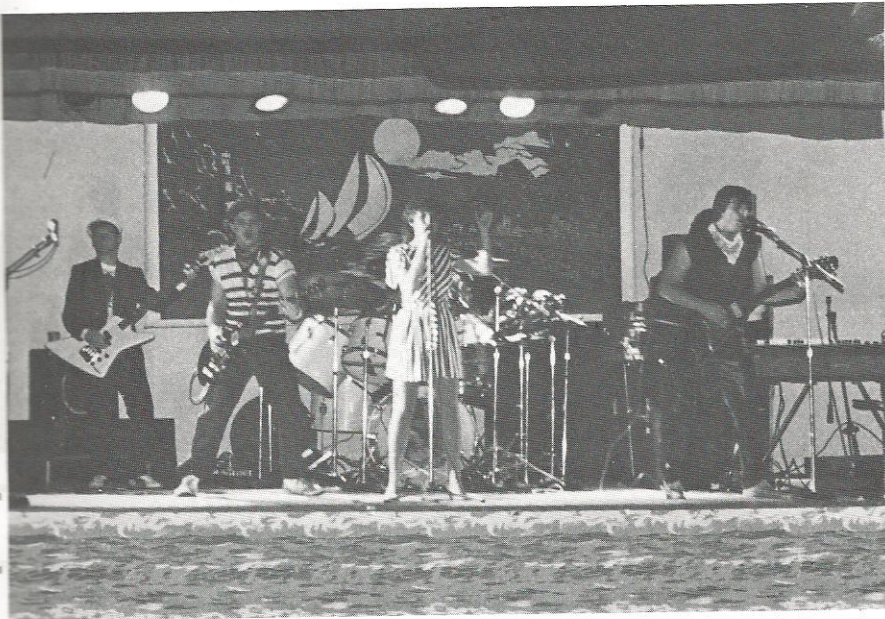
The band Back Roads entertains the students with their music.