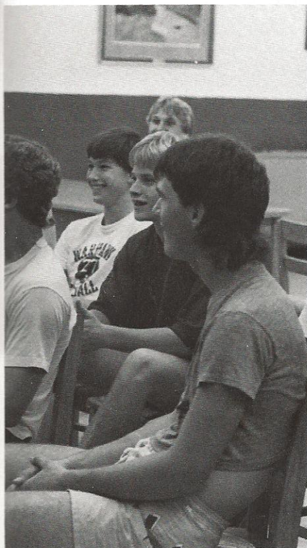
While in a meeting at which the team discusses their expectations for the next game, some of the players find something to amuse themselves.