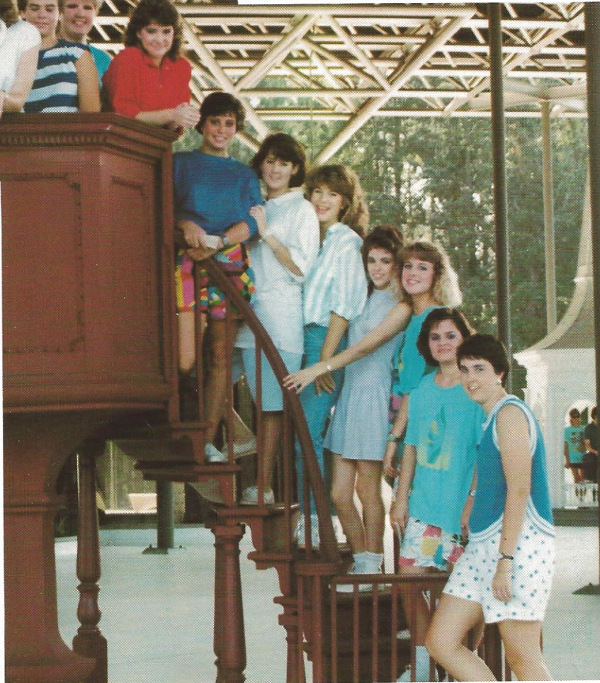
What a line-up! These senior girls show that the Class of '87 has beauty as well as brains.