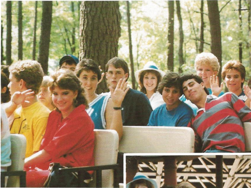
An enjoyable part of these seniors' day off to go to Charleston was their sight-seeing tour aboard the tram.